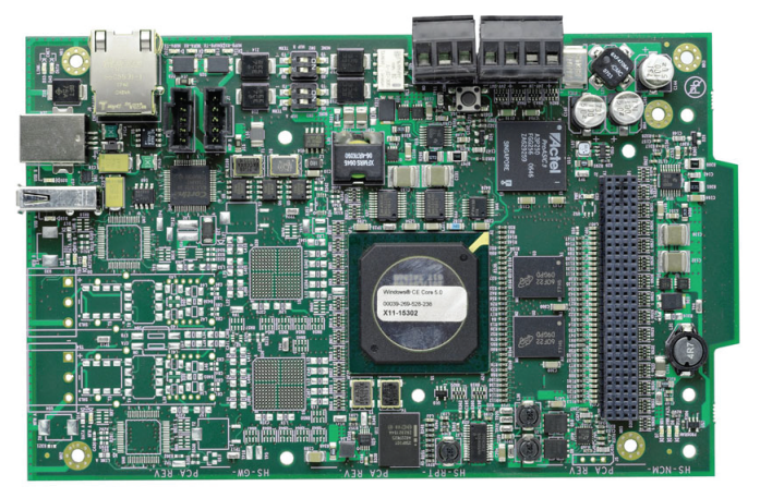
HS-NCM-HF, HS-NCM-SF, HS-NCM-MFSF