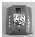
Indoor Wall Horn/Strobe