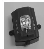
Outdoor Wall Strobe