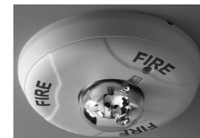
Indoor Ceiling Strobe