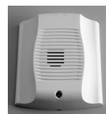
Indoor Wall Horn