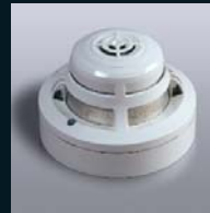
Advanced Fire & Smoke Detection