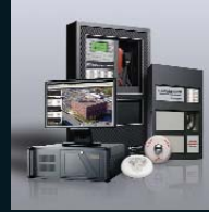
Emergency Communications Systems