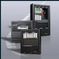
Fire Alarm Networks