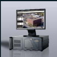
Fire, Security, CCTV Integration