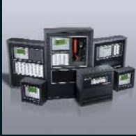
Fire Alarm Control Panels

For information on regional office locations throughout the world, please visit www.notifier.com .