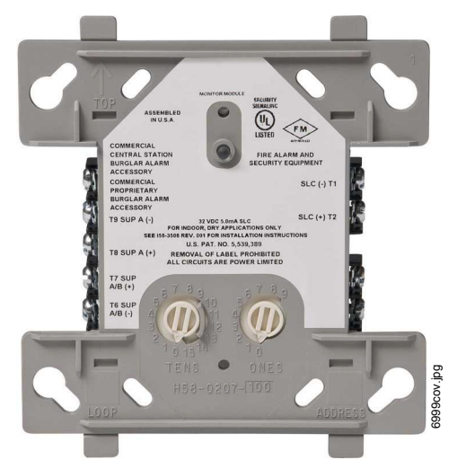
NMM-100(A) (Type H)

Use to monitor a zone of four-wire smoke detectors, manual fire alarm pull stations, waterflow devices, or other normallyopen dry-contact alarm activation devices. May also be used