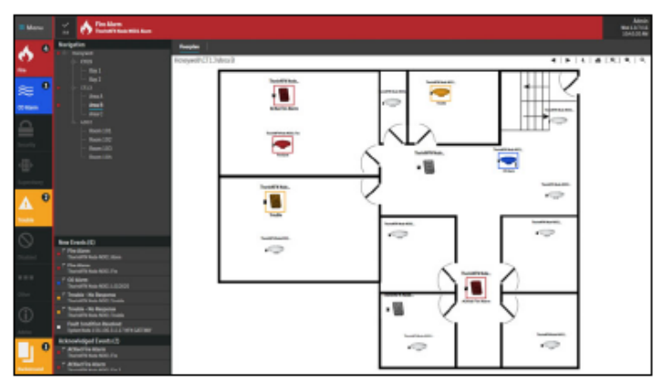
Monitor Multiple Sites From a Single Workstation

A single ONYXWorks Workstation can easily be set up and programmed to monitor multiple sites.